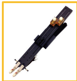
Magnetic column rail with cable-less HV connection enables columns of different lengths to be used in an analysis