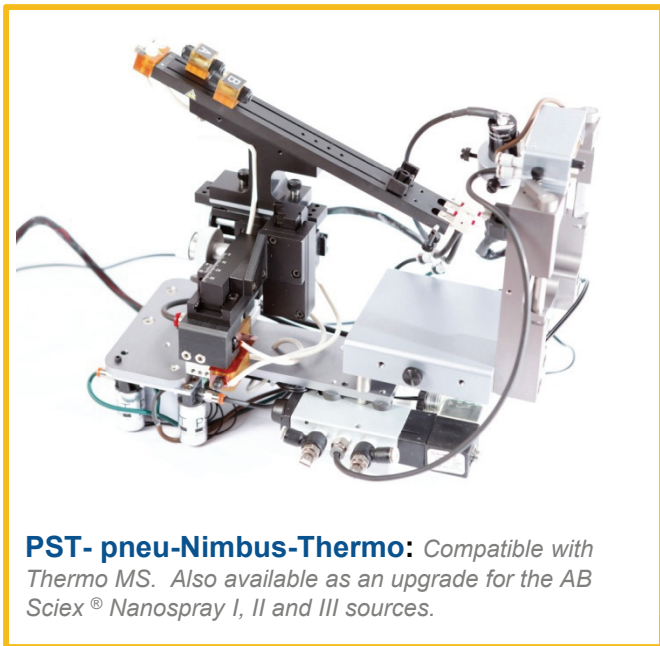
PST- pneu-Nimbus-Thermo: Compatible with Thermo MS. Also available as an upgrade for the AB Sciex® Nanospray I, II and III sources.